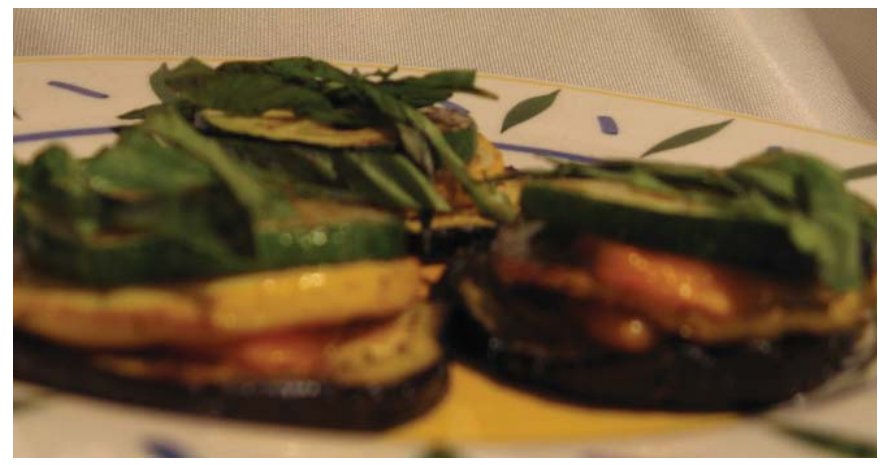
zucchini & eggplant towers